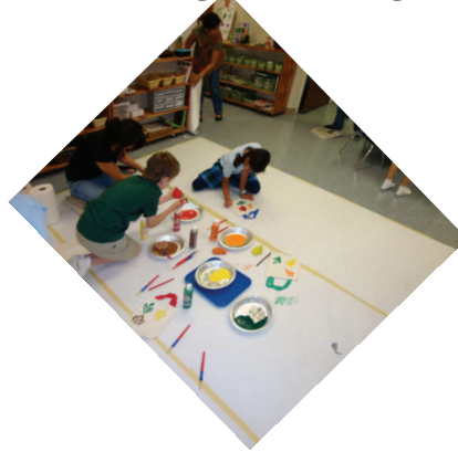
Canvas Bag Decorating